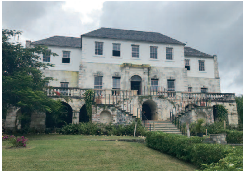
Clockwise from top: The 'haunted' great house at Rose Hall; the reception at GoldenEye with framed Fleming memorabilia; the statue of Noel Coward outside Firefly; Winston Churchill painting at Jamaica Inn; the Churchill Suite at Jamaica Inn from the outside

Now owned by a former Miss World USA, the house was restored in the 1960s, but immortalised for all eter-