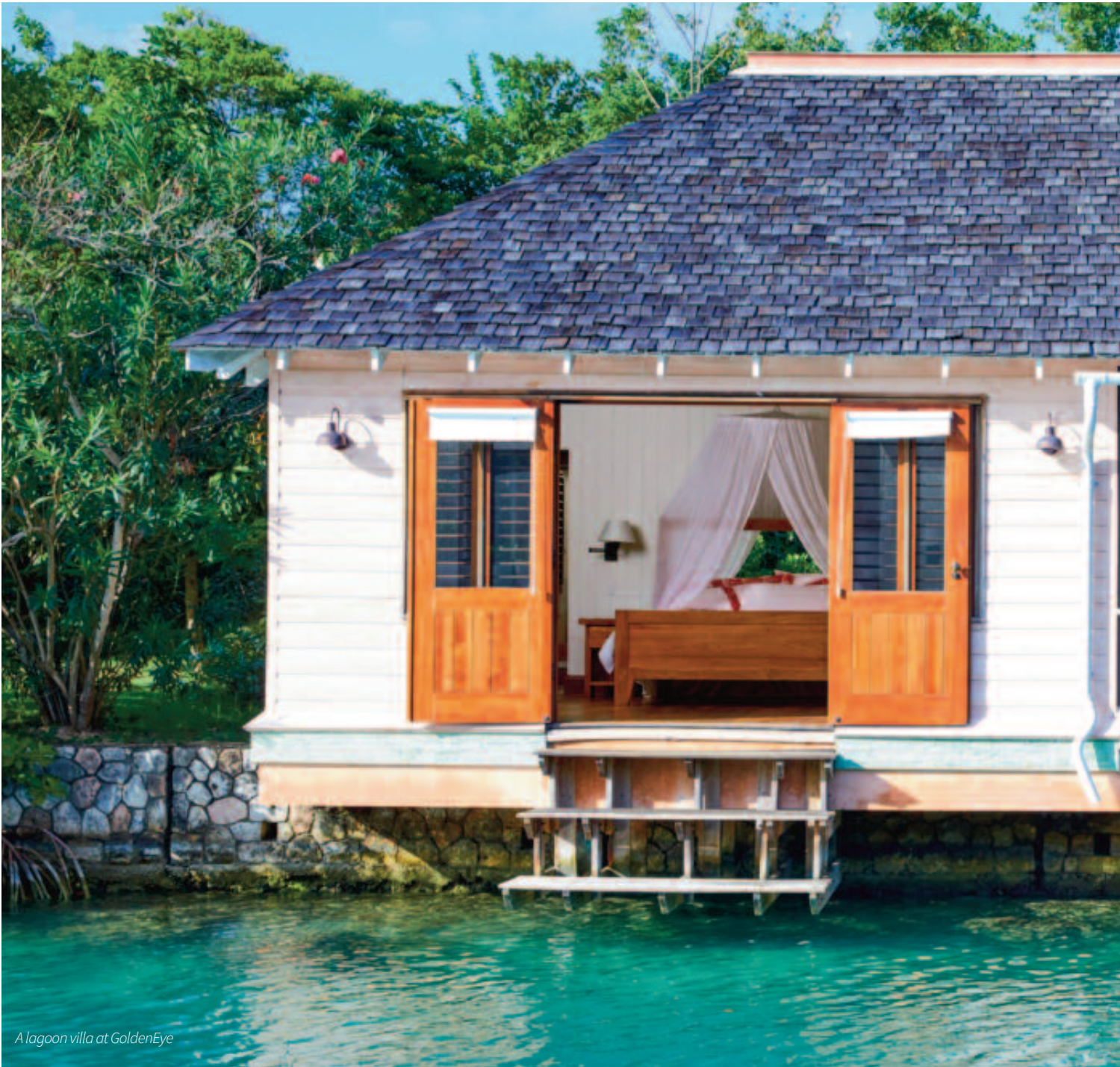
A lagoon villa at GoldenEye